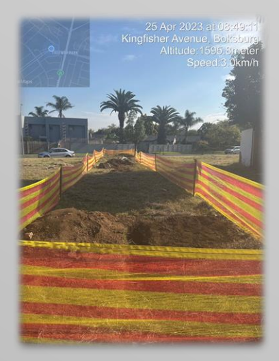
Civils According to Clients Requirements