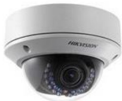
DS-2CD274PFWD-I 4MP WDR Vari-focal Dome Network Camera