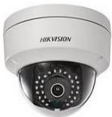
DS-2CD2142FWD-I(W)(S) 4MP WDR Fixed Dome Network Camera