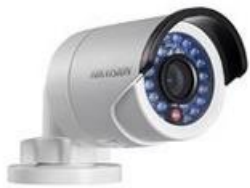
DS-2CD2042WD-I 4MP IR Bullet Network Camera