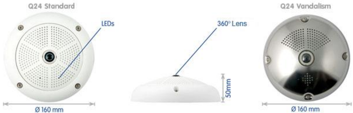
Cost Effective and Time Saving IP Surveillance

The Mobotix Q24 is an excellent camera for use in rooms with open spaces such as convenience stores, restaurants, office spaces, and gymnasiums. Thanks to its hemispherical lens, a single Q24 can monitor an entire room including the four corners. This approach can save a lot of expense and installation time when considering how many additional typical cameras would be needed to cover the same area.