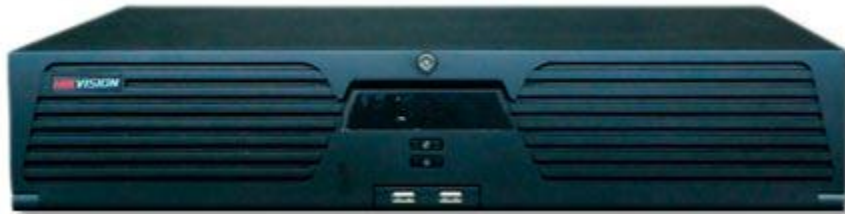
DS-9508/9516NI-S Embedded NVR