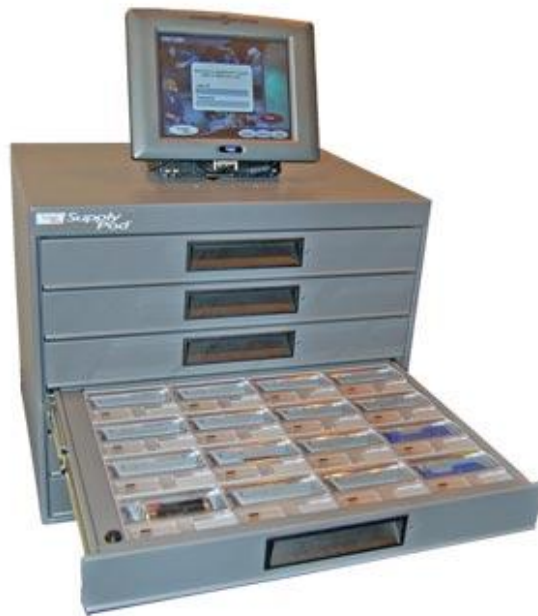
In figure 2 we have the Supplypod Figure 2