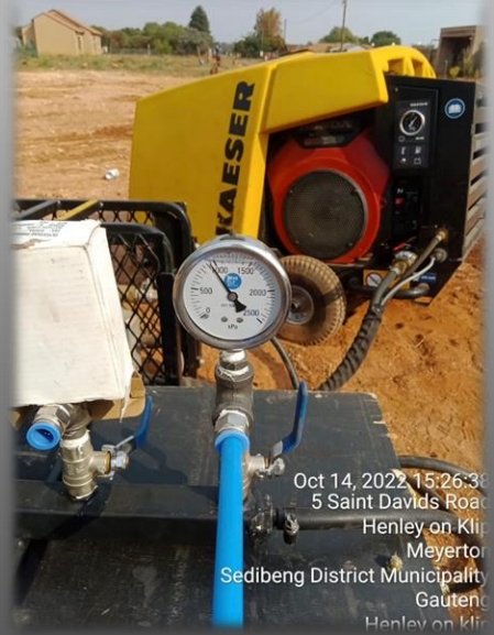
Oct 14, 2022 15:26:30 5 Saint Davids Road Henley on Klip Meyerton Sedibeng District Municipality Gauteng Henley on Klip