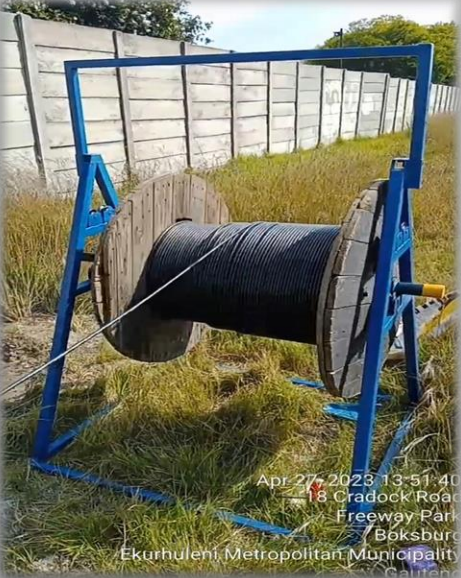
Fibre Floating From 4mm to 16mm in Diameter Duct Diameter 8mm to 50mm