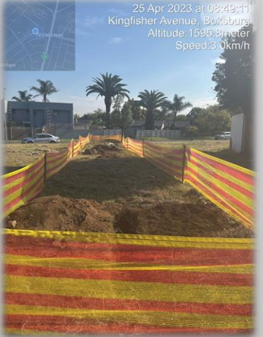
Civils According to Clients Requirements

25 Apr 2023 at 08:49:11 Kingfisher Avenue, Boksburg Altitude: 1595.8 meter Speed: 3.0 km/h